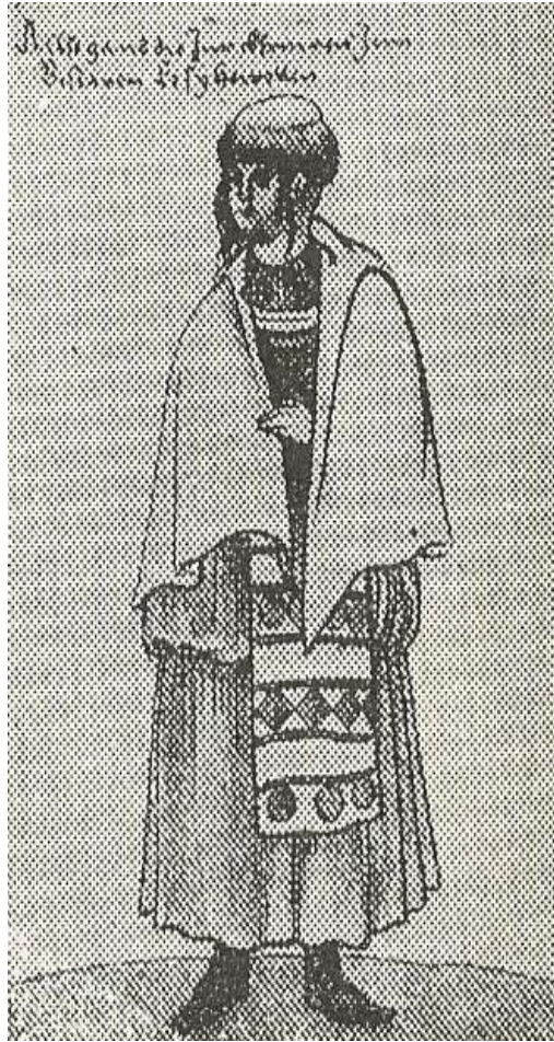
Figure 3. A girl with Beacumial tonsure or hairstyle, by the traveller and german printer Cristobal Weiditz, from 1529. Source: Garate, 1989, p. 73.