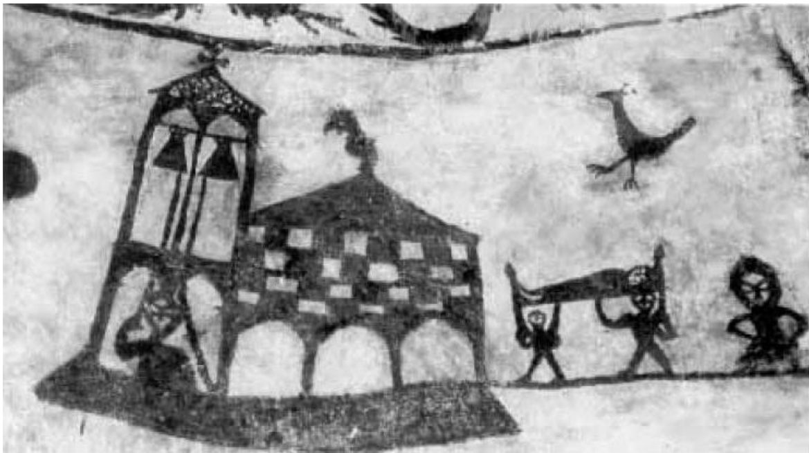
Figure 4. Funeral procession going to Church. Wall paintings in the apse of the Church of Nuestra Señora de la Asunción of Alaiza (Iruraiz-Gauna, Álava-Araba), 11th-13th c. Men carry the deceased, a woman, allegedly a serora , guides the procession (followed by another one, not seen on the photograph), and another alleged serora rings the bell.

The mentioned aspects may suffice to show that the hypothesis of the continuity and particular evolution of the ancient forms of Christian women religious in the Basque area has enough basis to be held. But the here exposed hypothesis not only speaks in favour of this continuity and evolution, but opens the door to the fact that non-enclosed feminine semi-religious institutions in Medieval and Modern Europe wouldn't be new phenomena, but already traditional lifestyles for women in a new context in which only the figure of the enclosed nun would become promoted as an ideal for women religious. And some of the names that the Basque seroras received in Spanish, indeed, apart from the same serora or sorora , were those given to these semi-religious women, such as freila (or freyra , freyla , etc.), beata , or emparedada .