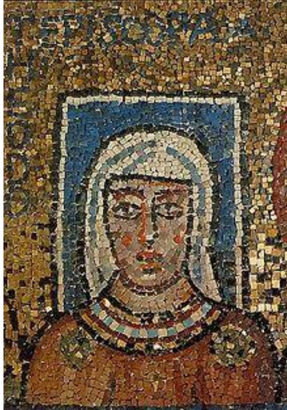
Figure 1. Theodo(r)a Episcopa, Bishopess Theodora (9 th c., mosaic in the Church of Saint Praxedis the Martyress, Rome). The last (ra) from her name was in later times erased, but the figure is clearly feminine, and Episcopa is the feminine form for Episcopus.

church authorities as the aforementioned facts came to scene, being the highest status' for women religious in a cultural context that emerged from a deeply patriarchal greco-roman background, and provided high quotes of religious and social power, and a not less important economic autonomy. In the case of Deaconesses (the most "accepted" ones), they would finally become rejected and forbidden in Western Europe by aprox. 10th-11th c., and yet later in Eastern Europe (Hannon, 1967, LaPorte, 1982, Rossi, 1991, Torjesen, 1996, Macy, 2000). Nonetheless, and although related to some nuns ("monjas que son letradas"), one of the latest attested mentions of "diaconissas" comes from Western Europe, from 14 th c. Segovia (Spain) (Martin, Linage Conde, 1987, 234).