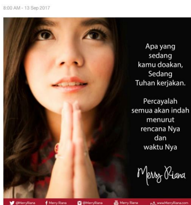
Figure 6. One of the posts on the Merry Riana official twitter account

In several examples above, it seems that Merry Riana is a figure who is very dependent on God. On her Twitter account dated September 13, 2017, Merry Riana shows her dependence on God.