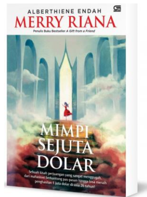
Figure 1. Mimpi Sejuta Dollar Book Cover