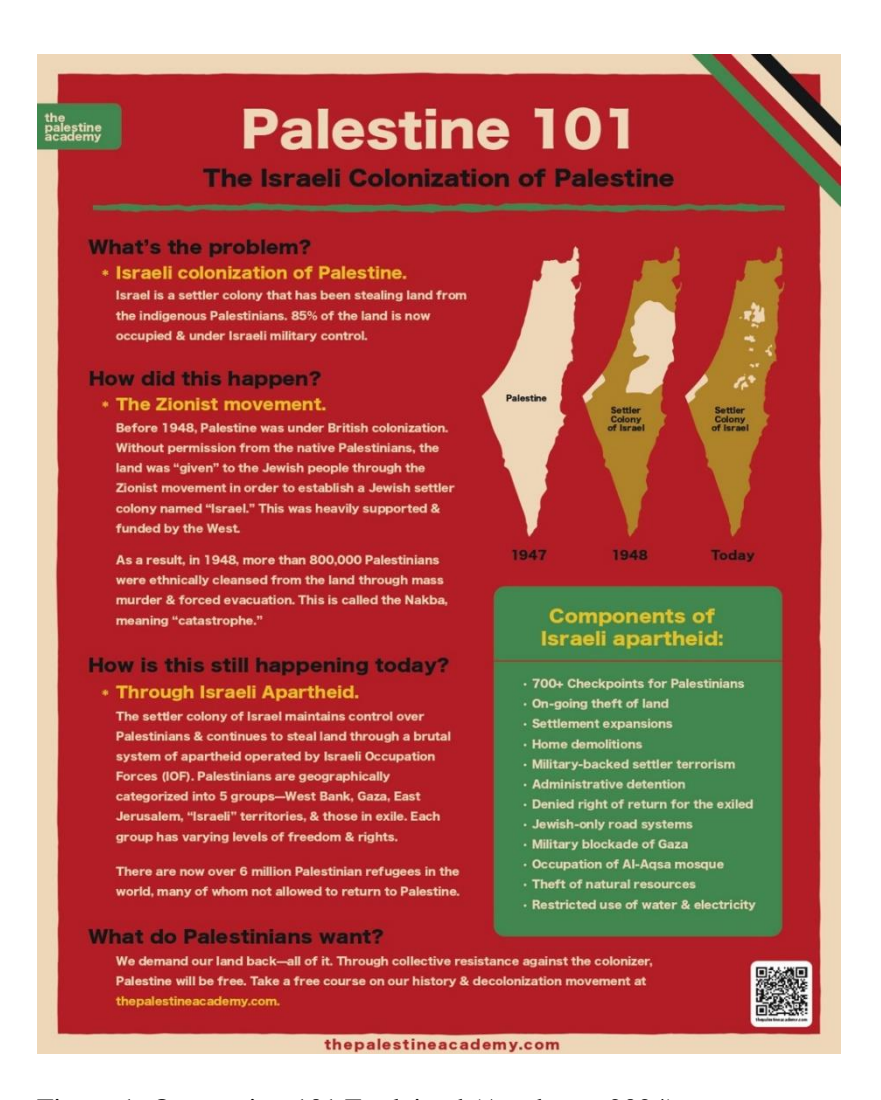
Figure 1: Occupation 101 Explained (Academy, 2024)