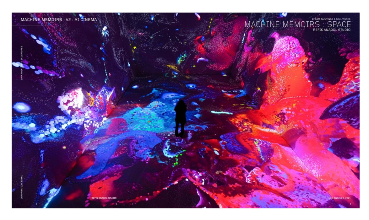
Figure 5: Refik Anadol, Machine Memoirs: AI Cinema