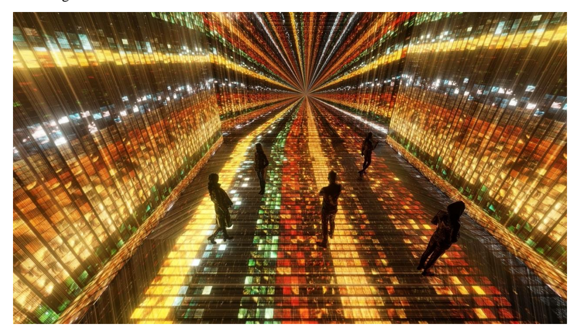
Figure 4: Exhibition view from Refik Anadol's "Machine Memoirs: Space" at Pilevneil Gallery in Istanbul, Turkey

achieve in real life. The 360-degree wrap-around scenes allow viewers to capture spectacle of spaces using waves of light and colour (Figure 4). Splendid scenes of light and electricity come to life in this interaction. However, for the somewhat densely-phobic viewer, such splendid scenes may seem a little dazzling.