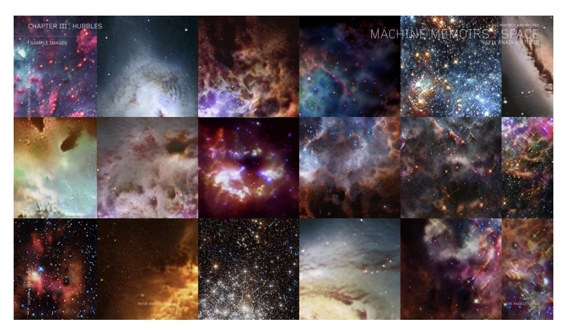
Figure 3: Refik Anadol, Machine Memoirs: Space, Chapter 3: HUBBLES, Sample Image

The sense of excitement comes mainly from uses of digital computer techniques, such as coding algorithms and data processing. These technology methods also require the conversion of electronic signals into output devices such as sound or LCD displays. Brockmann's insights into the algorithm contribute to our understanding of Anadol's spatial constructions. In Brockmann's view, it is not a technical or the digital system, but 'a particular form of coding symbolic content.' The coding symbolic feature of the algorithm create an exciting rapport between viewers and artists. From the perspective of viewers, Anadol's presentations of fabulous spaces of galaxy, outer space and other celestial bodies enable viewers to perceive and explore the ever-changing spaces, which are hard to