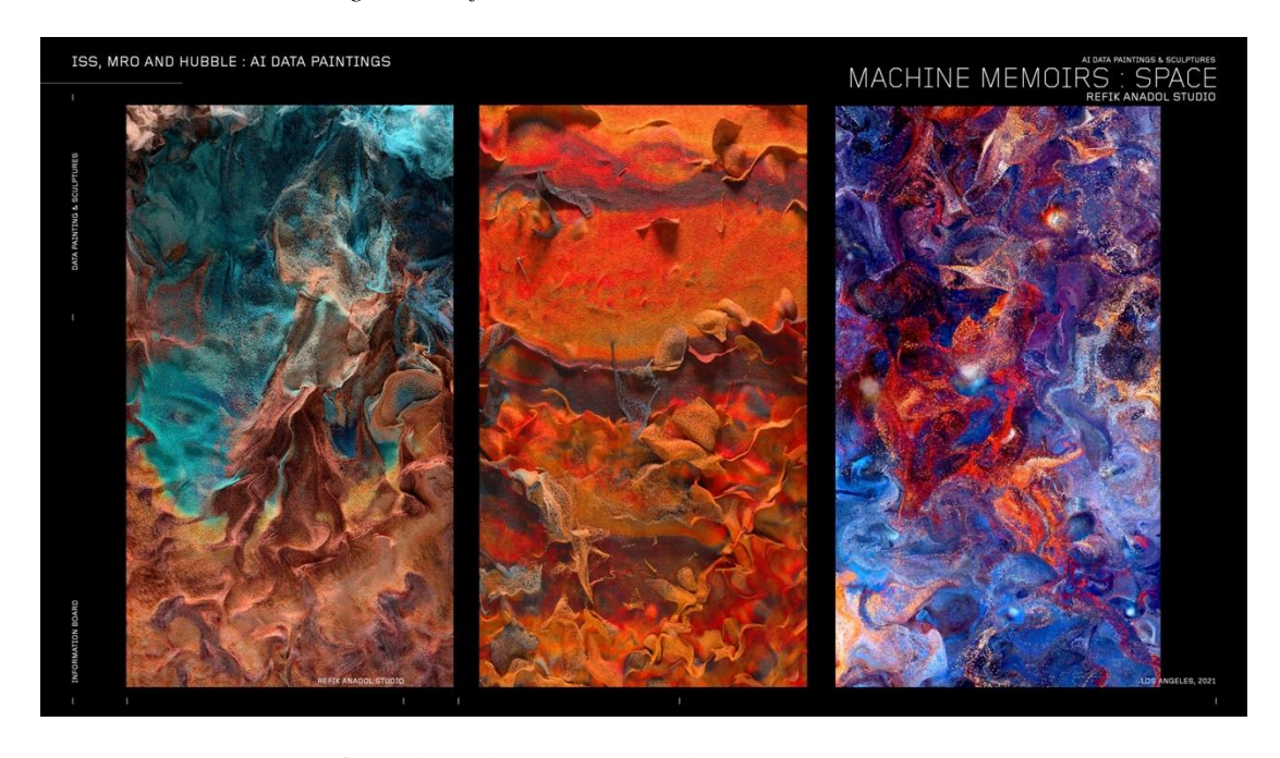
Figure 6: Refik Anadol, ISS, MRO and HUBBLE: AI Data Paintings

What also needs to be acknowledged is that overly realistic and vivid scenes brought by machines pose another problem for humans. The issue is that machines sometimes easily make the artist ignore the exploration of the work itself, and may fall into a vicious circle dominated by technology. From this, the relationship between machines and humans is not entirely beneficial. As we can see in artificial intelligence data paintings (Figure 6), the technical aspects, including texture, contrast and colour reproduction exceed those of direct camera shots. This poses a question, what is the purpose of the photographer's existence if the images can be composed and reconstructed by computers or machines, is it to provide a source of creativity? Broeckmann's research on image machine offers insights on understandings of images. He introduces the concept of "image anthropology", which was