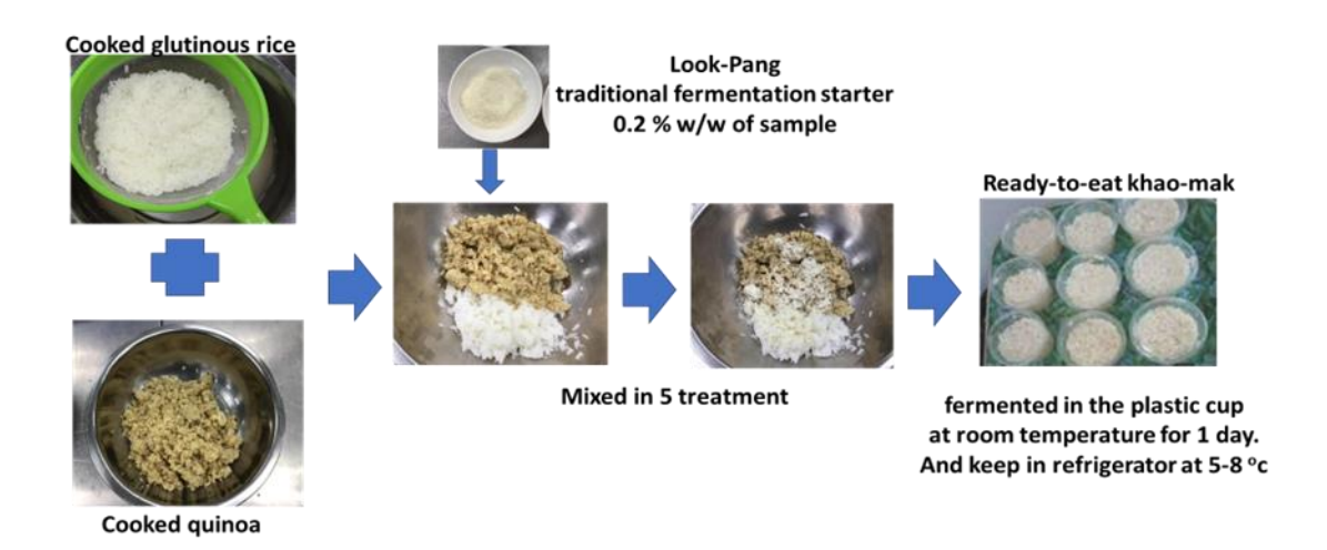
Figure 1. Khao-Mak Preparation Process

Glutinous rice and Look-Pang were all purchased from a local market in Mahasarakham. White quinoa purchased from supermarket in Mahasarakham. Glutinous rice were soaking in water for 4 to 10 hours then steaming over simmering water to cooked. Quinoa were cooked by boil in water for 15 minutes, remove from heat and covered for 10 minutes. Cooked glutinous rice and Cooked quinoa were mixed as various ratio in 5 treatment: Quinoa added 0%,30%,50%,70% and 100% of Quinoa. The batter was mixed with Look-Pang 0.2 % w/w of sample, and fermented in the plastic cup at room temperature for 1 day. And keep in refrigerator at 5-8 °C for analyzed. (figure 1)