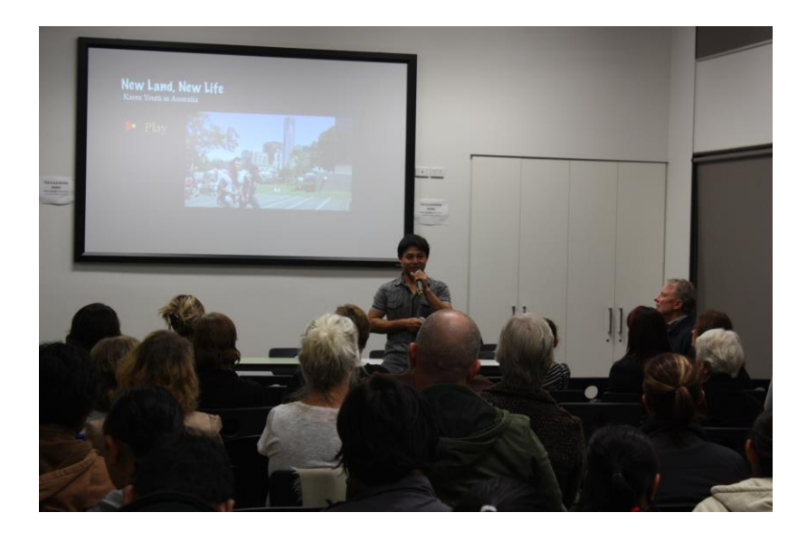
Figure 2 :The director introducing his documentary project at a screening event in Melbourne and receiving positive feedback

The documentary was screened at several community events in Melbourne in early 2013 and received quite positive feedback. Some of the audiences who worked for local government, community-based or religious-based organisations, for example, commented that watching the documentary allowed them to appreciate and understand more about the problems that young Karen have faced. Besides public screening, the documentary also has been distributed in DVD, mainly through the AKF networks. The director got supportive responses from those who bought the DVDs and said that they were inspired by the story of the Karen youth presented in documentary New Land, New Life.