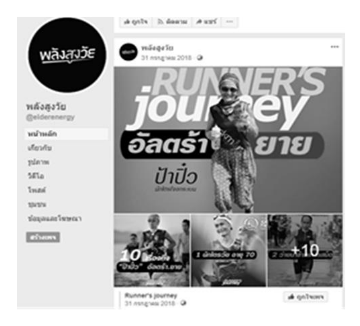
Figure 6 Encourage old people to exercise for health.

Facebook fan page called "@GenOldThaiPBS" )Elderly Together( is created by Thai PBS (Television station). The content types focus on technology knowledge, seminar and public dialogue, public relations for inviting the audience to join the GenO (LD) documentary program about the elderly society. Most of content poste from other websites toward the GenOldThai fan page. Communication patterns used link from blog, YouTube, Facebook live for encouragement and inspiring the elderly audience.