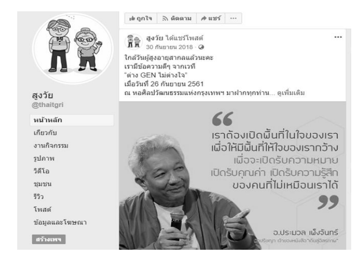
Figure 5 Inspiration content for elderly @thaigri Fan Page

Facebook fan page called @thaigri is created by the Thai Elderly Research and Development Institute (PSU). They are posted behavioral content regarding social norm and social role, knowledge content about elderly protection right, elderly news, knowledge-driven dialogue, elderly rights protection system. Property management of the elderly, health news on exercise and healthy food for the elderly. The communication patterns by sharing news links from other website, such as policy of Elderly Protection Right from government organisation mostly, the elderly health news, health education training, and inspiration content respectively. Moreover, using verbal communication via video clips and infographic to share elderly lifestyle stories.