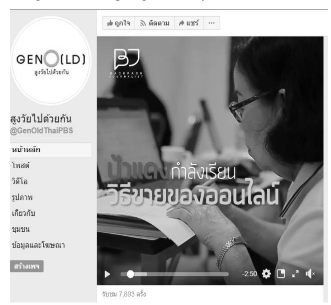
Figure 7 Inspire elderly to learn how to sell product online

Facebook fan page called "@GenOldThaiPBS" )Elderly Together( is created by Thai PBS (Television station). The content types focus on technology knowledge, seminar and public dialogue, public relations for inviting the audience to join the GenO (LD) documentary program about the elderly society. Most of content poste from other websites toward the GenOldThai fan page. Communication patterns used link from blog, YouTube, Facebook live for encouragement and inspiring the elderly audience.