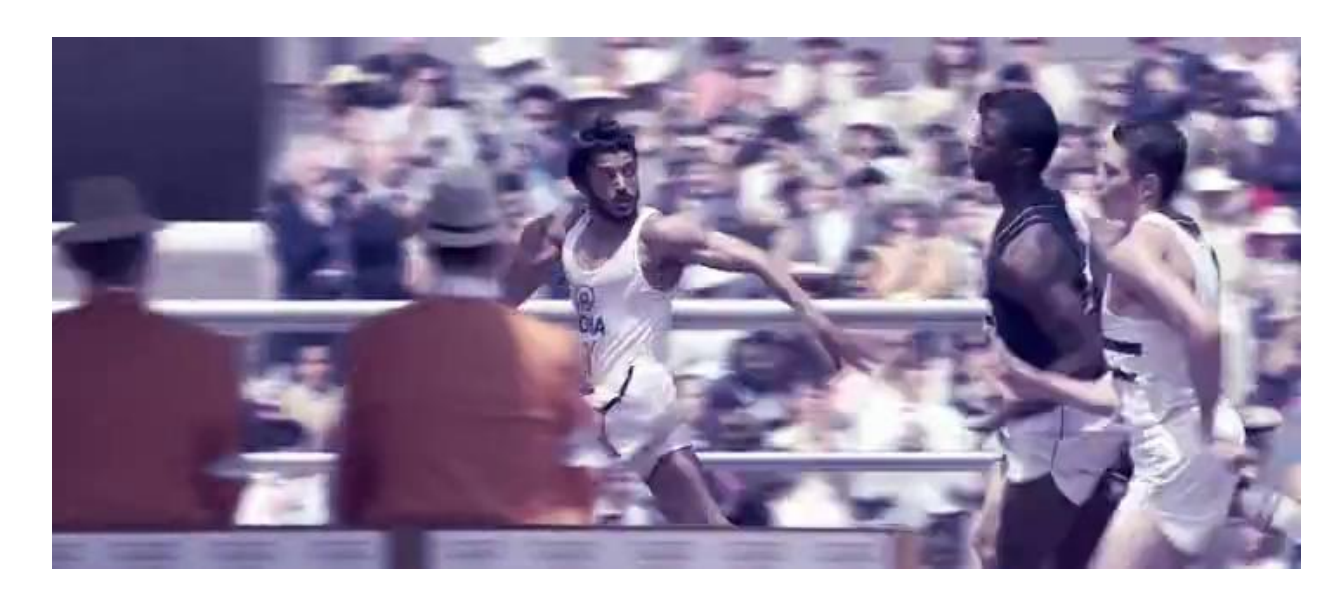
(A shot from the movie 'Bhaag Milkha Bhaag')