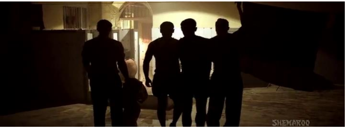
(A shot from the movie 'Bhaag Milkha Bhaag')