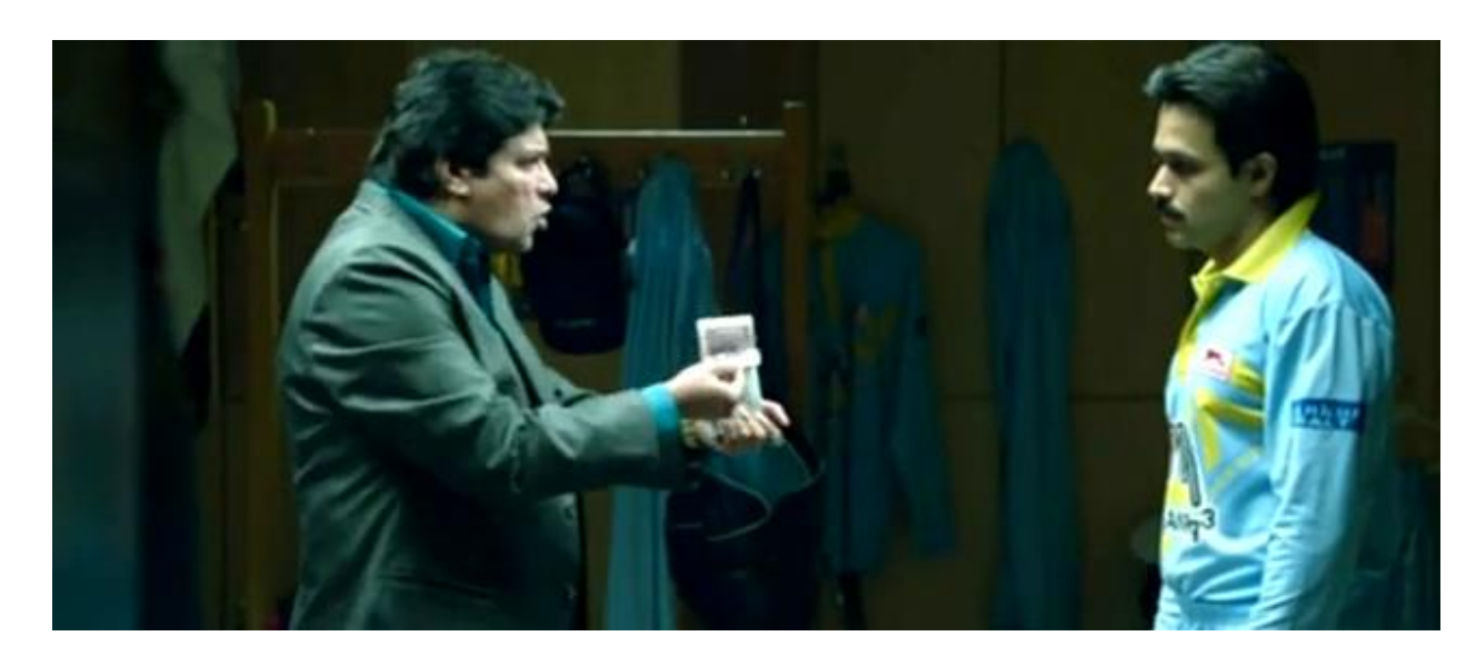
(A shot from the movie 'Azhar')