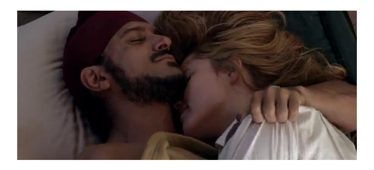
(A\ shot\ from\ the\ movie\ `Bhaag\ Milkha\ Bhaag\ `)