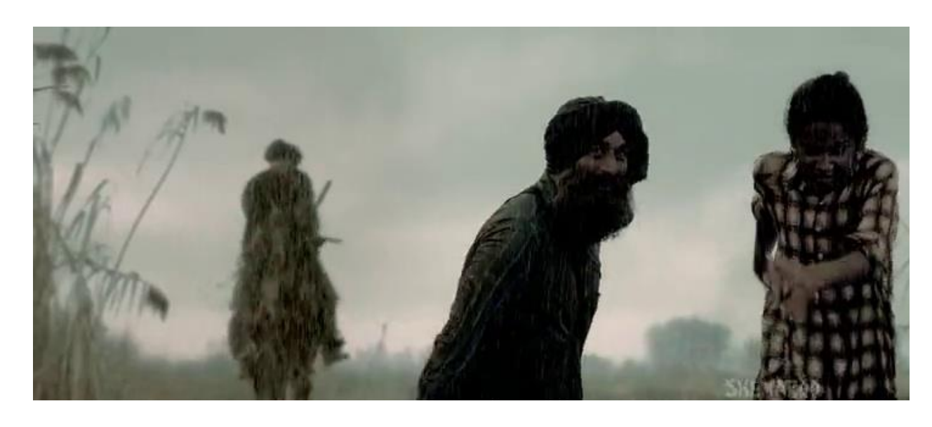
(A shot from the movie 'Bhaag Milkha Bhaag')