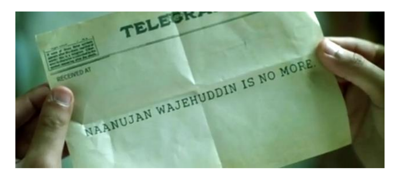
(A shot from the movie 'Azhar')