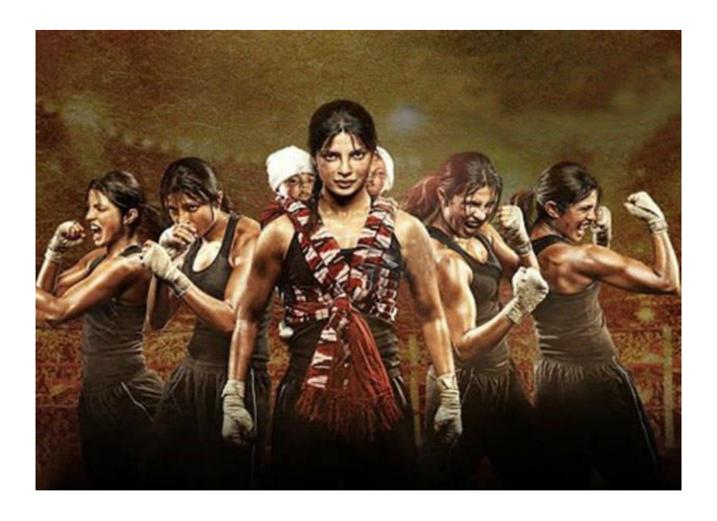
(A shot from movie 'Mary Kom')