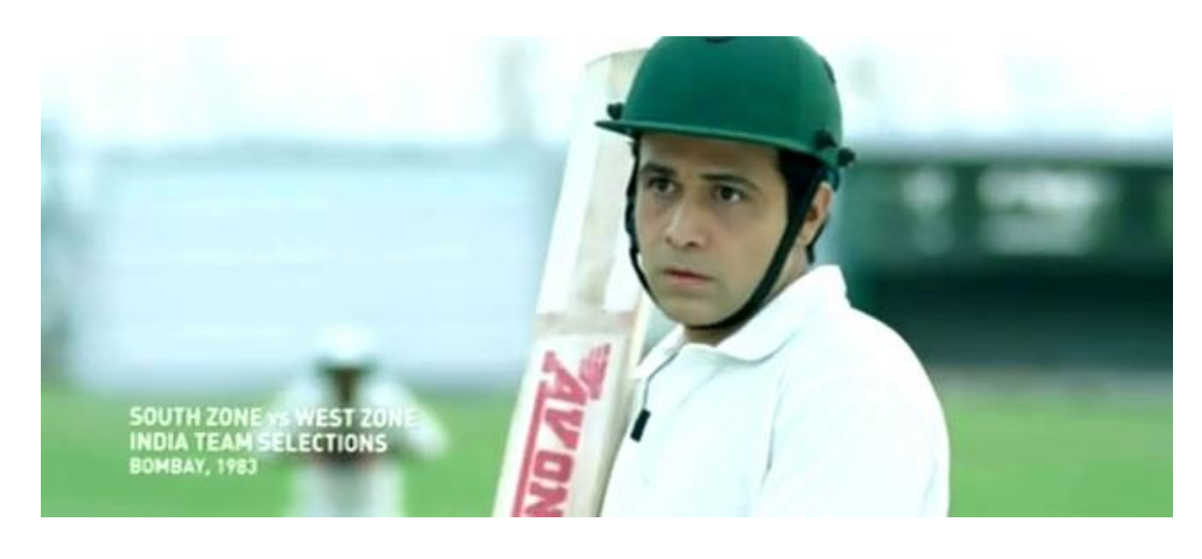
(A shot from the movie 'Azhar')