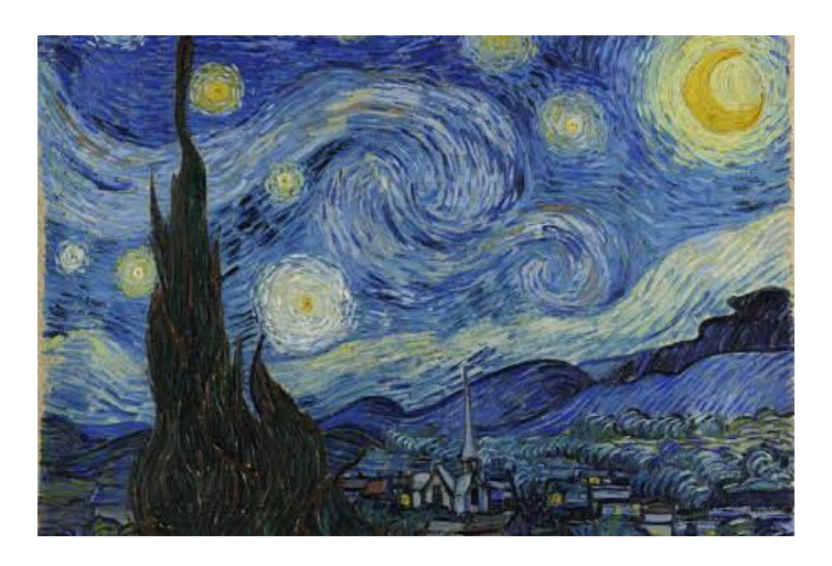
Figure 5: The famous painting 'The Starry Night' by Vincent Van Gogh portraying the view of dawn from his window with an imaginary village