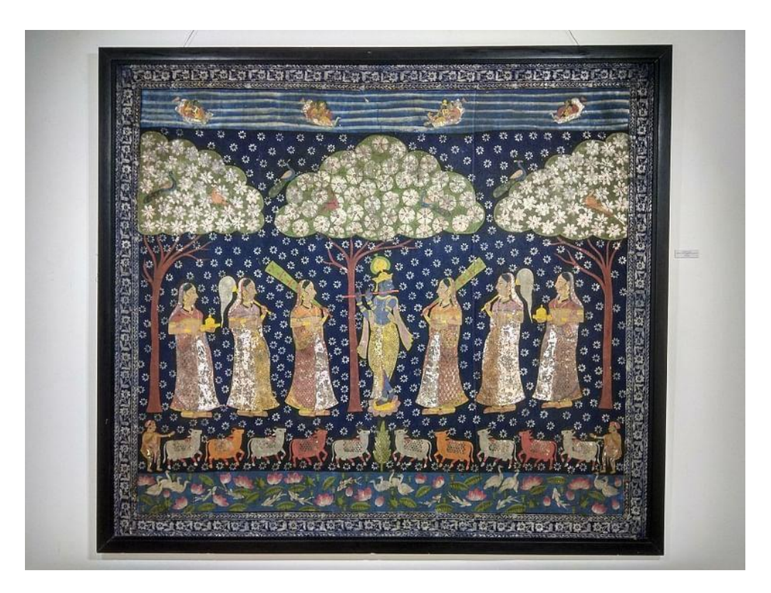
Figure 7: Pichwai Painting, a Traditional Form of Art in ICA Gallery representing indulgence of culture in their imagination