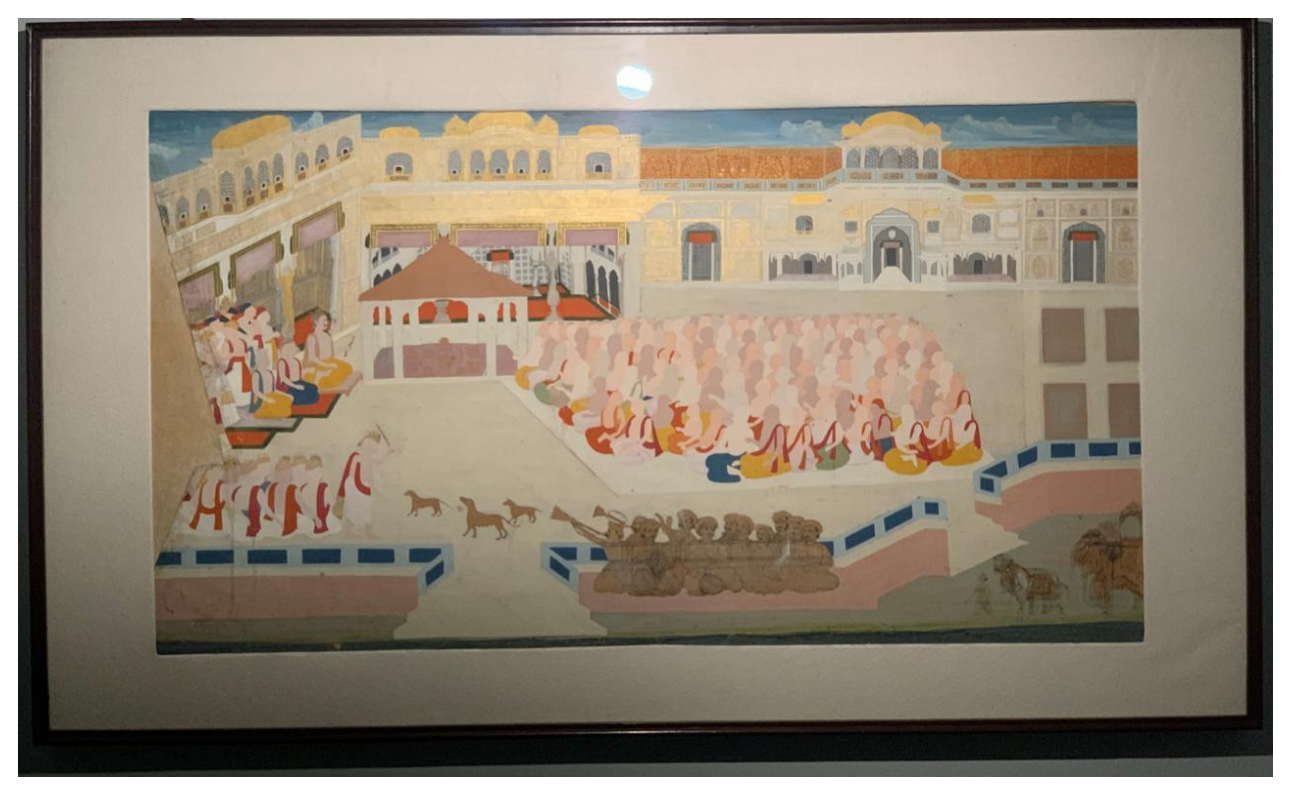
Figure 1: An Incomplete Court Scene wherein the Artist emphasizes on architectural background rather than people attending the Court, captured from Sawai Man Singh II Museum of Jaipur

than the people attending the court room. When these participants were confronted for their views of the unfinished Painting presented in figure 1, their responses differed highly. The students viewed them with a cultural point of view, the businessman viewed it with respect to the kingship and power held by the king. The research analyst spotted minute details of intricacies in buildings. However, the artist was impressed with the scene captured that can give a live time travel to the court scene that has live music going on. This clearly indicates the approach taken in the form of functional freedom of expression which is spread in different directions of imagination without a minimal possibility of coincidence. Even though the participants appreciated creativity of the artefacts presented in the museum and gallery, their point of view with which they saw and appreciated is indifferent.