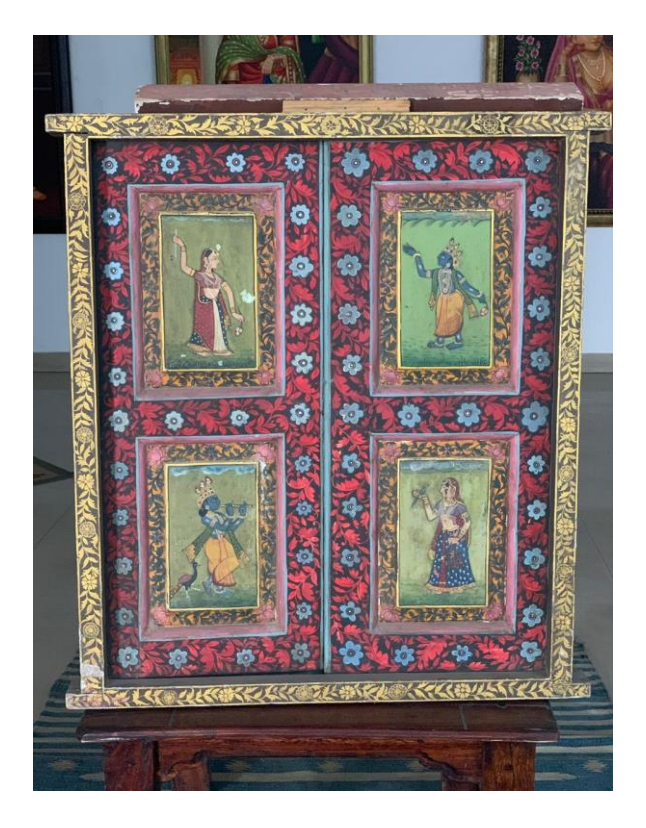
Figure 4: A piece of Gate wherein the cultural traditions of welcoming is intended by the Leela of Lord Krishna and Radha