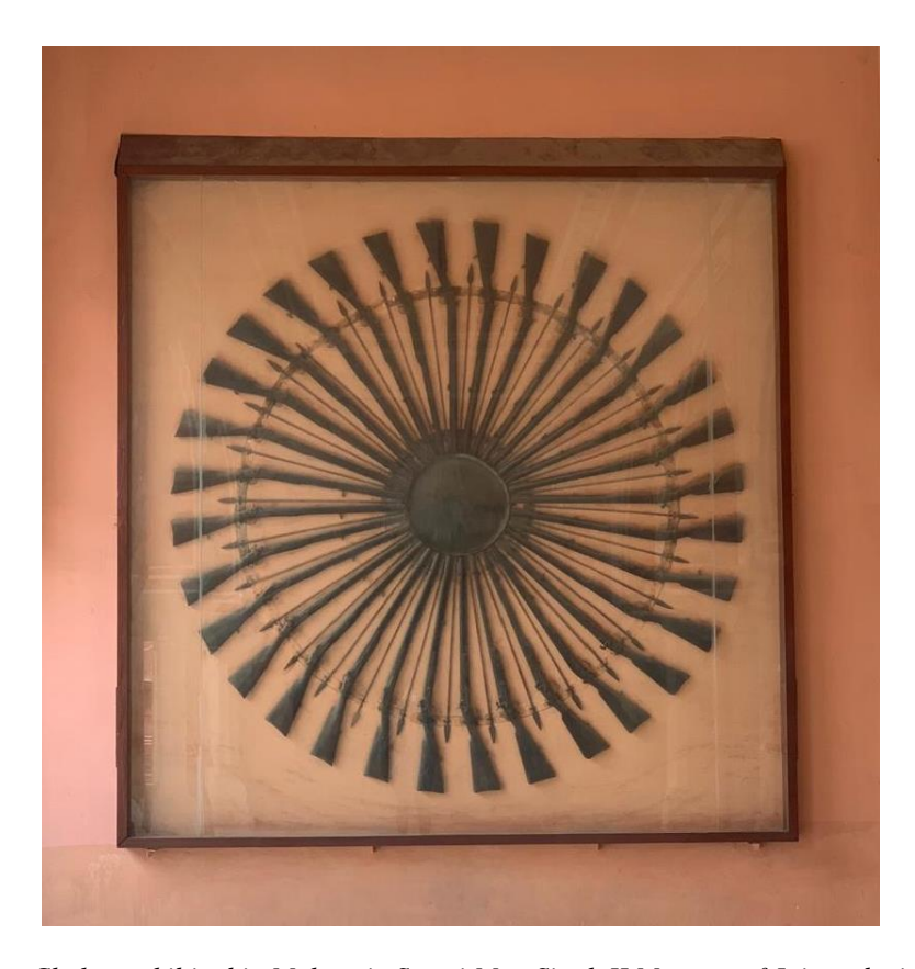
Figure 2: Surya Chakra exhibited in Maharaja Sawai Man Singh II Museum of Jaipur depicts closeness of artists with their culture.