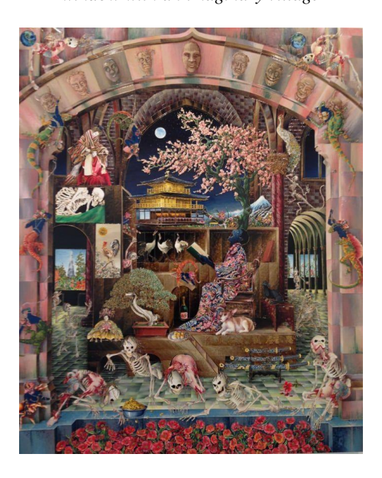
Figure 6: A Painting by Raqib Shaw representing imagined paradises, reflecting a freedom of imagination