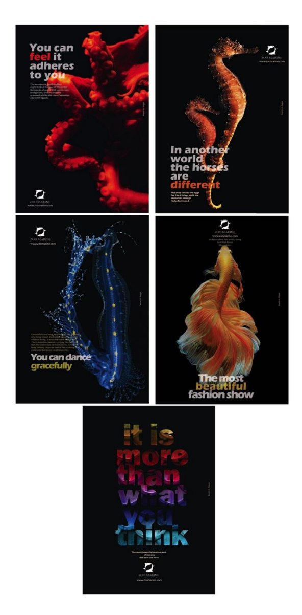
Figure 3 The work for the visiting student for the ZOO project