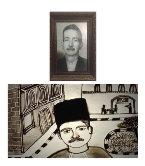
Figure 5 Sabir's scene. At top is the original; bottom is the first team's emulation.