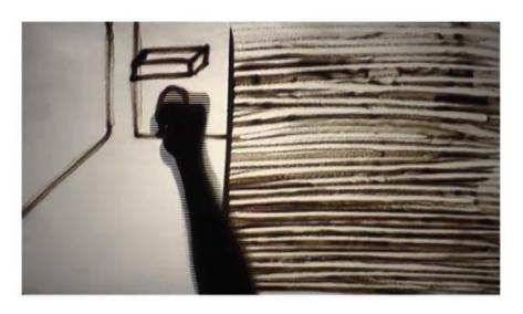
Figure 6 sample of the stripped shadow following the artist's arm in the scenes.

• An unacceptable striped shadow remained seen throughout the scenes following the artist's arms (Figure 6). The team insisted that this is an unsolvable technical obstacle.