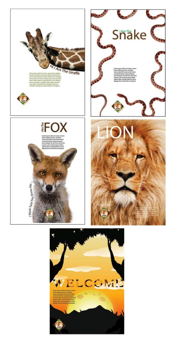
Figure 2 The work of the second student for the ZOO project