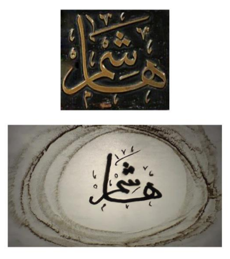
Figure 4 the first scene. At top is the original; bottom is the first team's emulation.

• The first scene (Figure 4) requires a drawing of the movie's logo that consists of calligraphy in the Arabic language. The team missed to match it with the initial due to technical issues.