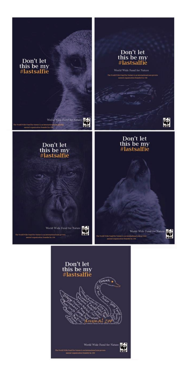
Figure 1 The work of the first student for the ZOO project.