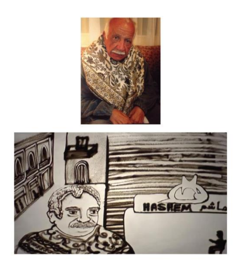
Figure 7 Hashim's scene. At top is the original; bottom is the first team's emulation.

• There was no sense of perspective in most of the scenes (Figure 8).