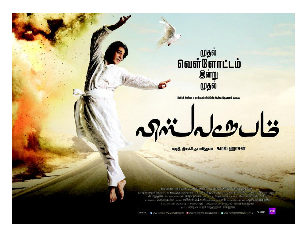
Figure 6 Viswaroopam (The Cosmic Form), Poster, 2013