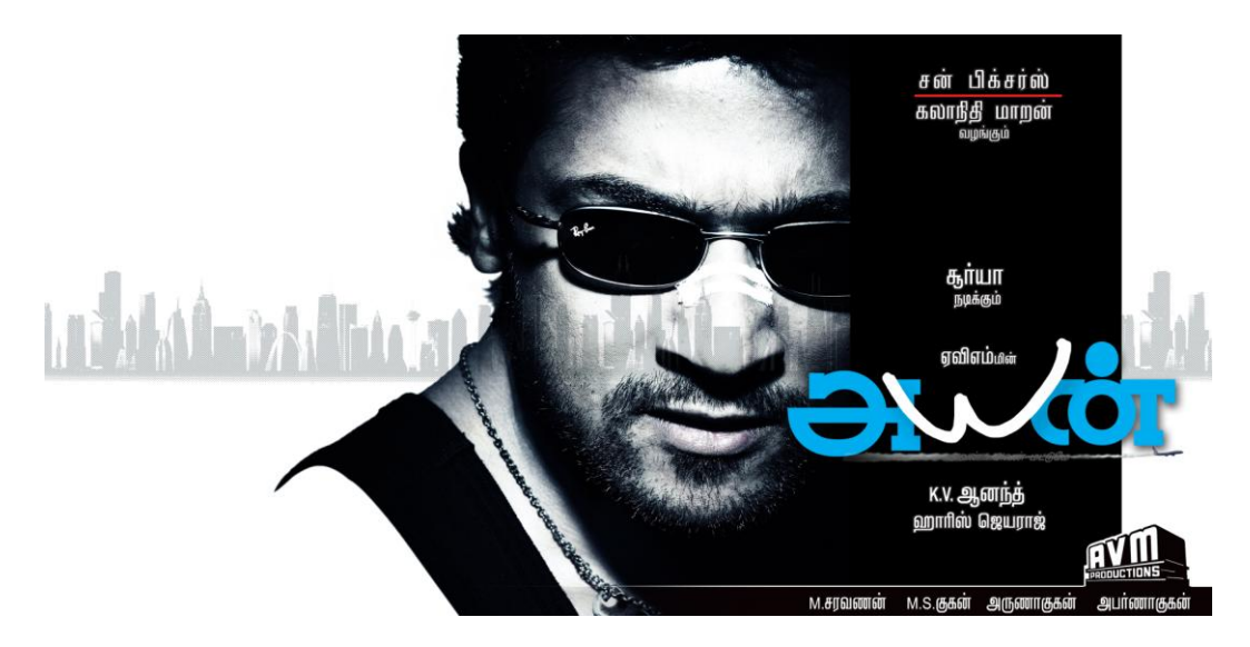
Figure 1 Ayyan (Unique), Hoarding, 2009

Chennai, which enjoys a happy balance between the traditional and the modern, exhibits the same in its publicity of Tamil films as well. Outdoor advertising for Tamil cinema, while being hinged to the cinema that it publicizes, has emerged as a site of negotiation for recent and advancing technologies and socio-cultural trends. The pivot of this negotiation is the creativity of the designer augmented by the available technological devices that has brought in slick and sophisticated advertising solutions for the Tamil film industry. While elevating the Tamil film viewers' sense of reception, the audience is now receiving visual stimuli akin to the global viewer.