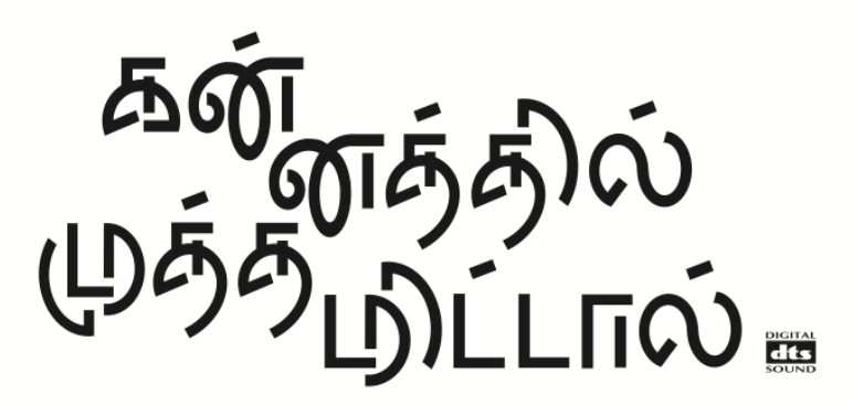
Figure 4 Kannathil Muthamittal (A Peck on the Cheek) Title Design, 2009