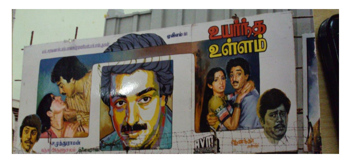
Figure 2 Uyarndha Ullam (Noble Heart) Hoarding, 1985