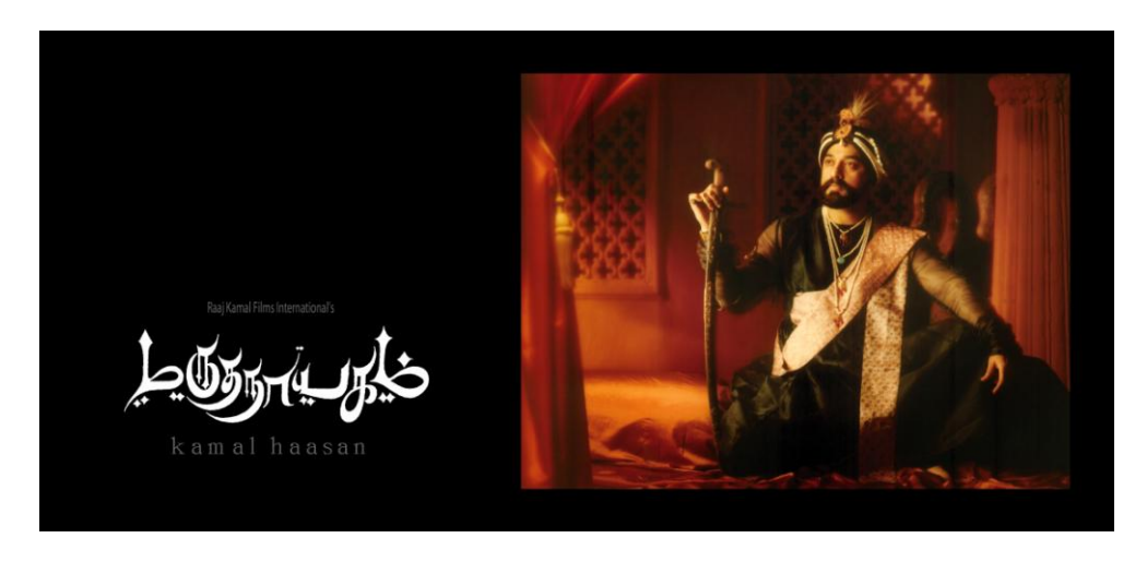
Figure 5 Marudhanayagam (yet to be released)