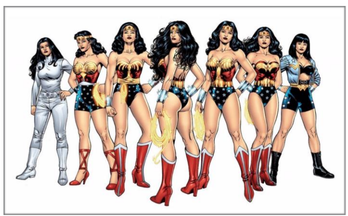
Figure 3 Wonder Woman dress from past and future. http://cbldf.org/2012/10/tales-from-the-code-whatever-happened-to-the-amazing-amazon-wonder-woman-bound-by-censorship/.

do, unlike housewives and women in love working in a romantic world shown in visual media. In addition, Wonder Woman has become an advocate of feminism with views such as women understanding their potentials and demanding equality of rights (Sabin, 2003, p. 86). After the Second World War, the images of women in visual media reflected a conservative social and political climate. The place of women in the home was strengthened in the media with pastoral images of family life and happy housewives. Love and romance comics always empower women by making choices and sacrifices for love with a happy ending (Aktaran Klein, 1991, 31). But by the 1950s, the clothes that many super women characters were wearing and the extremely obscene visual elements created in their sex enabled the emergence of authority laws in the comics. Comics Code Authority banned display and explicit illustrations by the 1954s, which wanted to eliminate the excesses of the comic book industry and allow children to read characters that women are portrayed as healthy (Madrid, 2013, p. 31) (Figure 3).