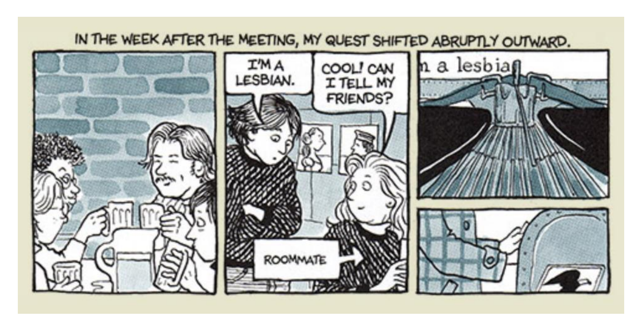
Figure 6 A panel from Alison Bechdel's graphic novel, Fun Home http://goodokbad.com/index.php/reviews/fun_home_review.

"Sex activist Susie Bright argues that for an individual, the form of comics provides an invaluable space for nuanced desires: Apart from the comics, there is no other place where you can find the truthful and detailed pictures to show your life in stereotypical and delusional life using live photos" (Chute, 2010, p. 4).