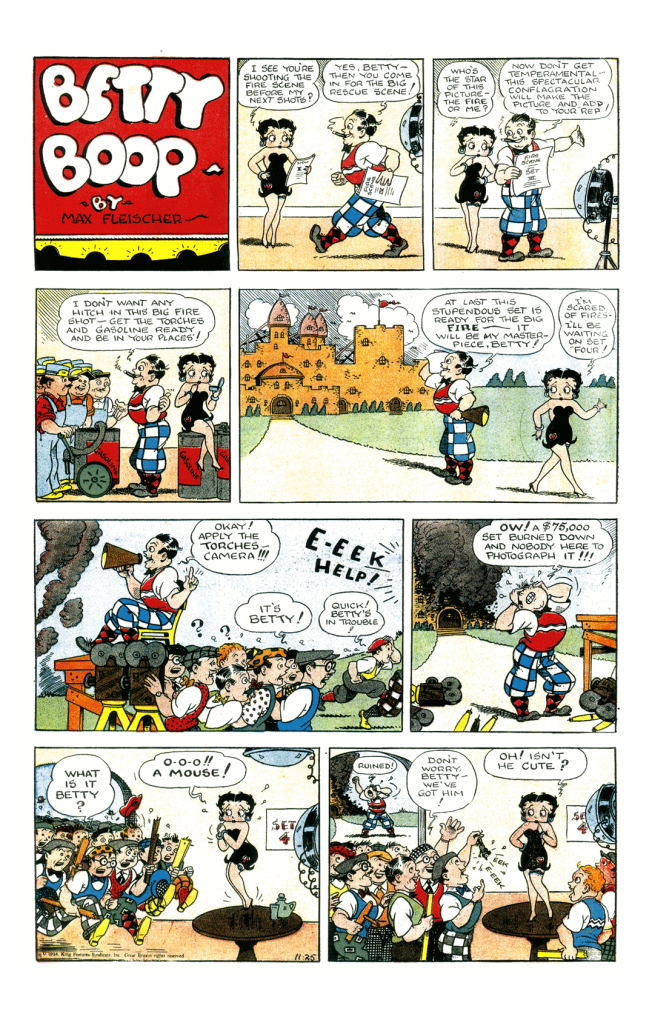
Figure 2 In addition to showing her sexuality, she is always portrayed as an innocent and sweet character. Betty Boop, Sunday 25 November 1934, by Max Fleischer.