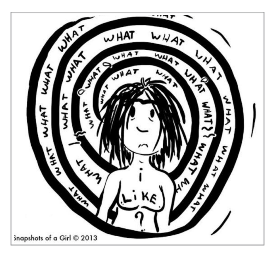
Figure 7 Beldan Sezen, Snapshots of a Girl, 2015, https://www.indiegogo.com/projects/snapshots-of-a-girl#/.

Therefore, in the graphic novels and comics, women can express themselves without objectification, together with the fourth wave feminism movement. Instead of sexy and pornographic women that never exist, characters depicted based on women existing in society are more popular. But nowadays, something about comic books has changed. Instead of comic books that were previously published as printed publications, there are motion comic books today. With the impact of technological developments and new media environments, it has become digital in comics. In these animated comics, female characters can be described without any gender prejudices compared to the past. For example: The comic book called Lesbian Zombies from Outer Space is positive in terms of handling the life of lesbians in the context of gender, but it is a negative example because these women are objectified.